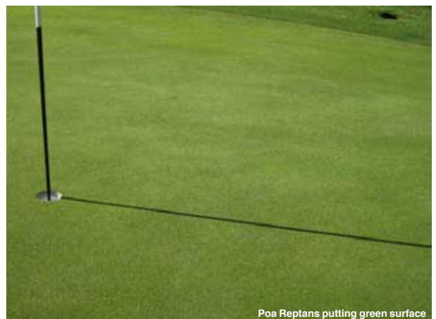
Poa Reptans putting green surface