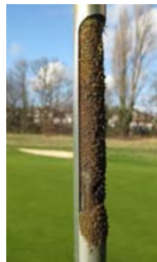
BELOW: Summer aeration – 8mm tines, followed by a sand dressing