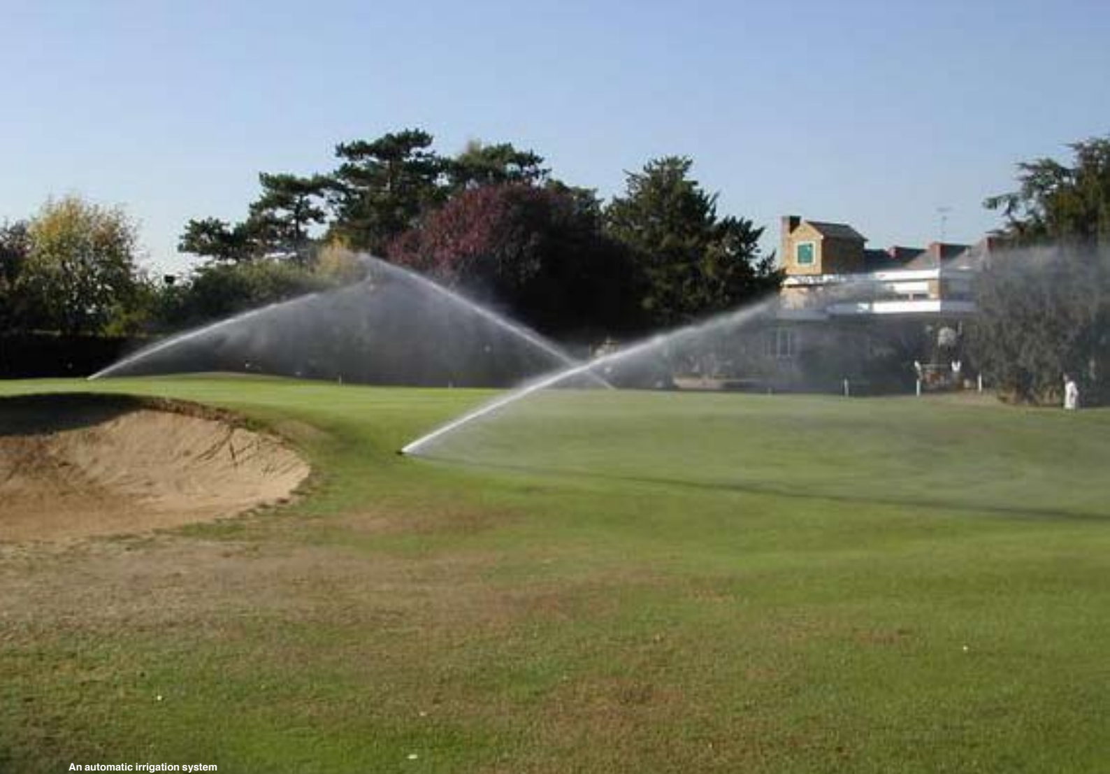
An automatic irrigation system