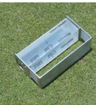
A prism gauge – used to tell the 'true' cutting height.